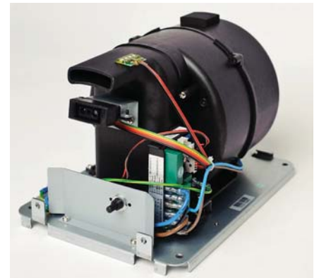
Under the Cover