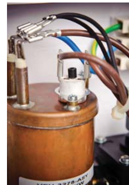
Thermal Cut Out